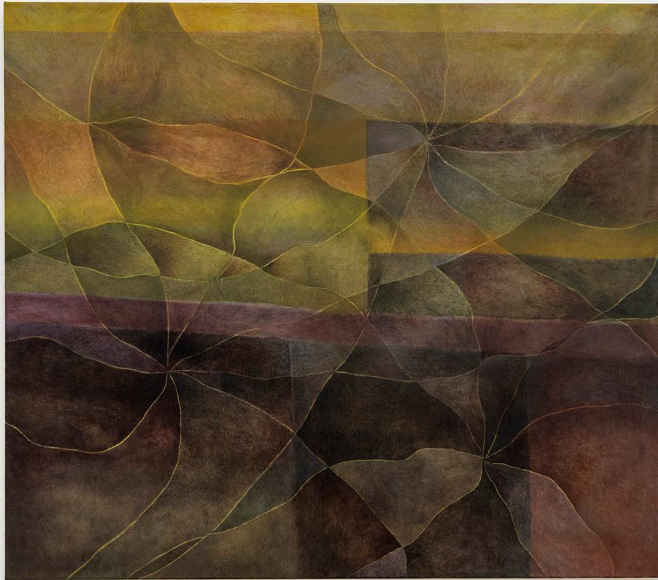
David Egan I don't want to look it up anymore, 2025 Oil on canvas 107 x 122 cm