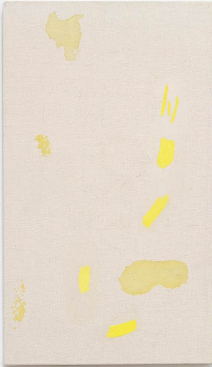
Cathy Wilkes Rivulet , 2025 Gouache, paper and pigment on silk and linen 70.60 x 40 x 2 cm