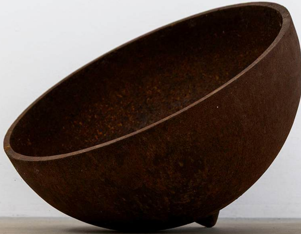
Simryn Gill Half Moon Shine (miniature version) , 2012 Raw steel 27.50 x 37.50 x 37.50 cm