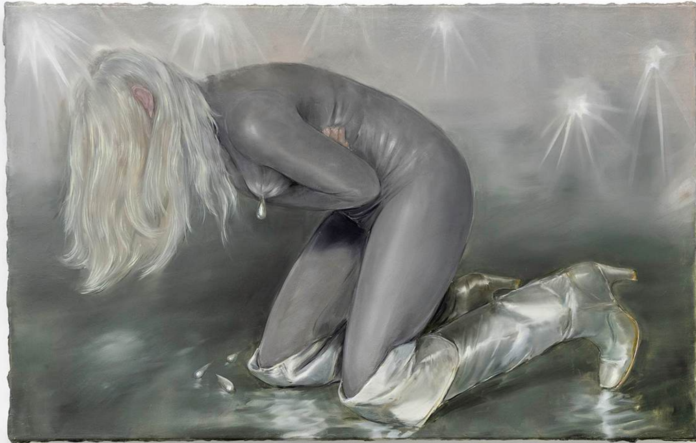
Jelena Telecki Death of a Disco Star , 2026 Oil on canvas 79 x 125 cm