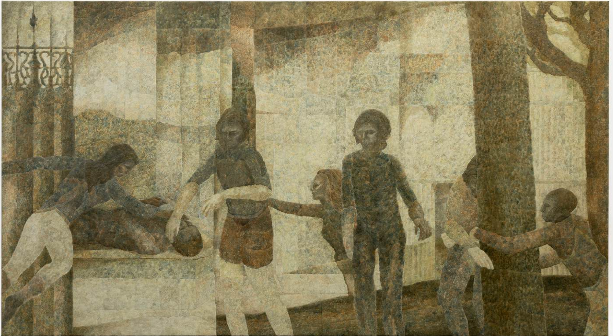
Tim Bučković untitled , 2025-26 Oil on linen 125 x 227 cm